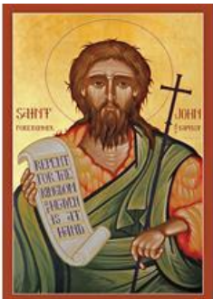
St. John the Baptist

There have been two notable feast days this week: Saints John Fisher and Thomas More on Tuesday and the Birthday of St. John the Baptist on Thursday. All three men showed great courage in holding firm to the truth and all lost their lives as a consequence. These saints are also examples of how to be humble and detached from worldly power, riches and influence. May we grow in faith and courage holding firm to what we know to be right and may we allow the Lord to enter ever more fully into our hearts and minds.